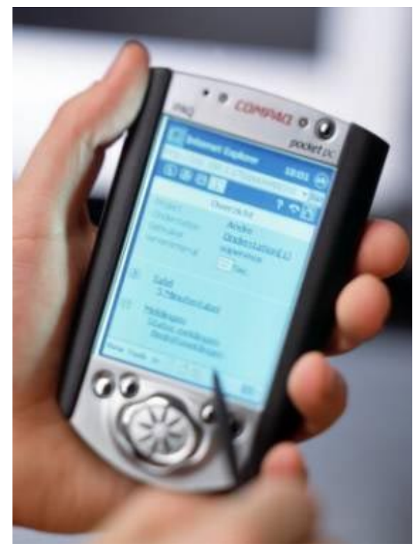
Illustration 2: Browser operation and PDA enable the building management system to be controlled from any location

When employing remote control operation no concessions can be made to user friendliness, whereas with mobility the 'portable aspect' is important as users are not prepared to carry around a laptop all day. Fortunately Internet technology provides excellent solutions. To provide the same ease of operation with a browser as with an individual PC application on a workstation, a new display language, SVG (Scalable Vector Graphics), has been developed. Photographs, drawings, installation diagrams, etc are displayed in detail and at a surprisingly high speed.