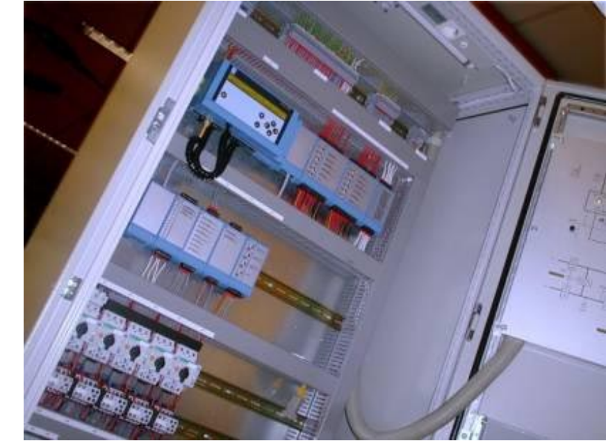
Illustration 1: Modern control computers with fully integrated Internet technology are being introduced into building management systems

TCP/IP can be used with existing network structures: networks that allow companies to communicate between its remote subsidiaries. If these networks are also utilised by the BMS, then information from various subsidiaries can easily be collated and exchanged making the distance between buildings much less important.